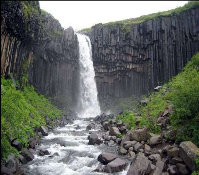
Svartifoss (Black waterfall)