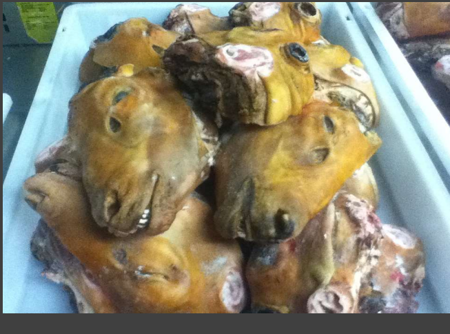
2. Picture = Slátur (Slaughter)