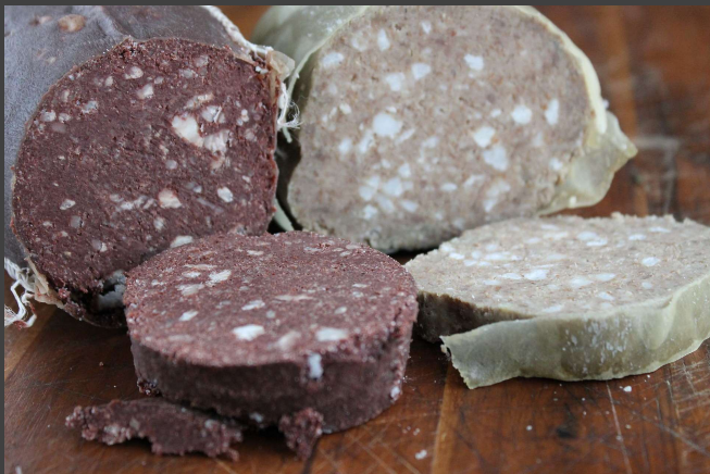
2. Picture = Slátur (Slaughter)