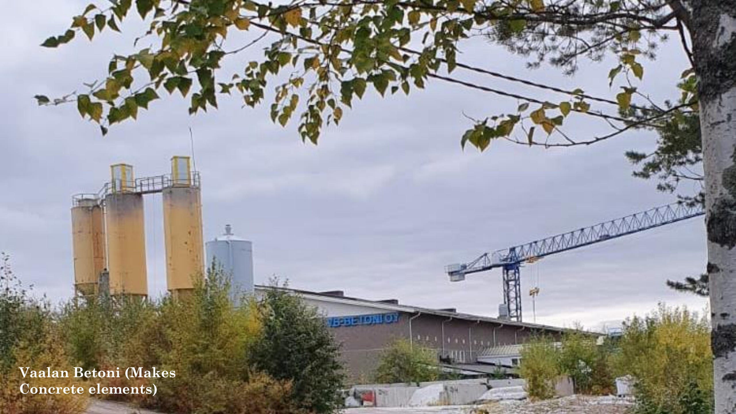
Vaalan Betoni (Makes Concrete elements)