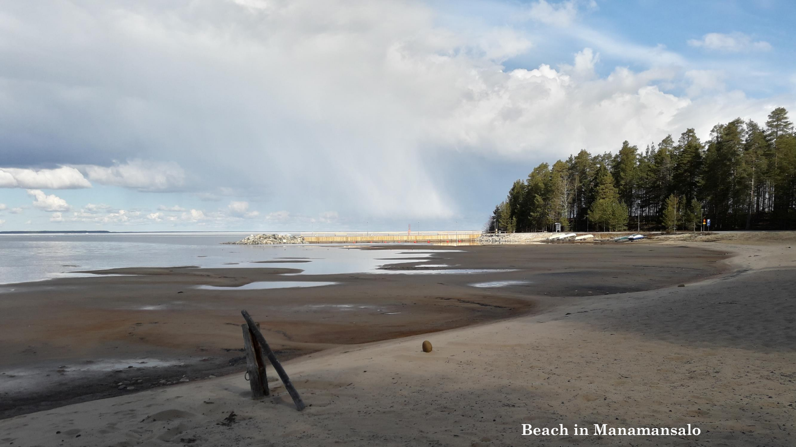
Beach in Manamansalo