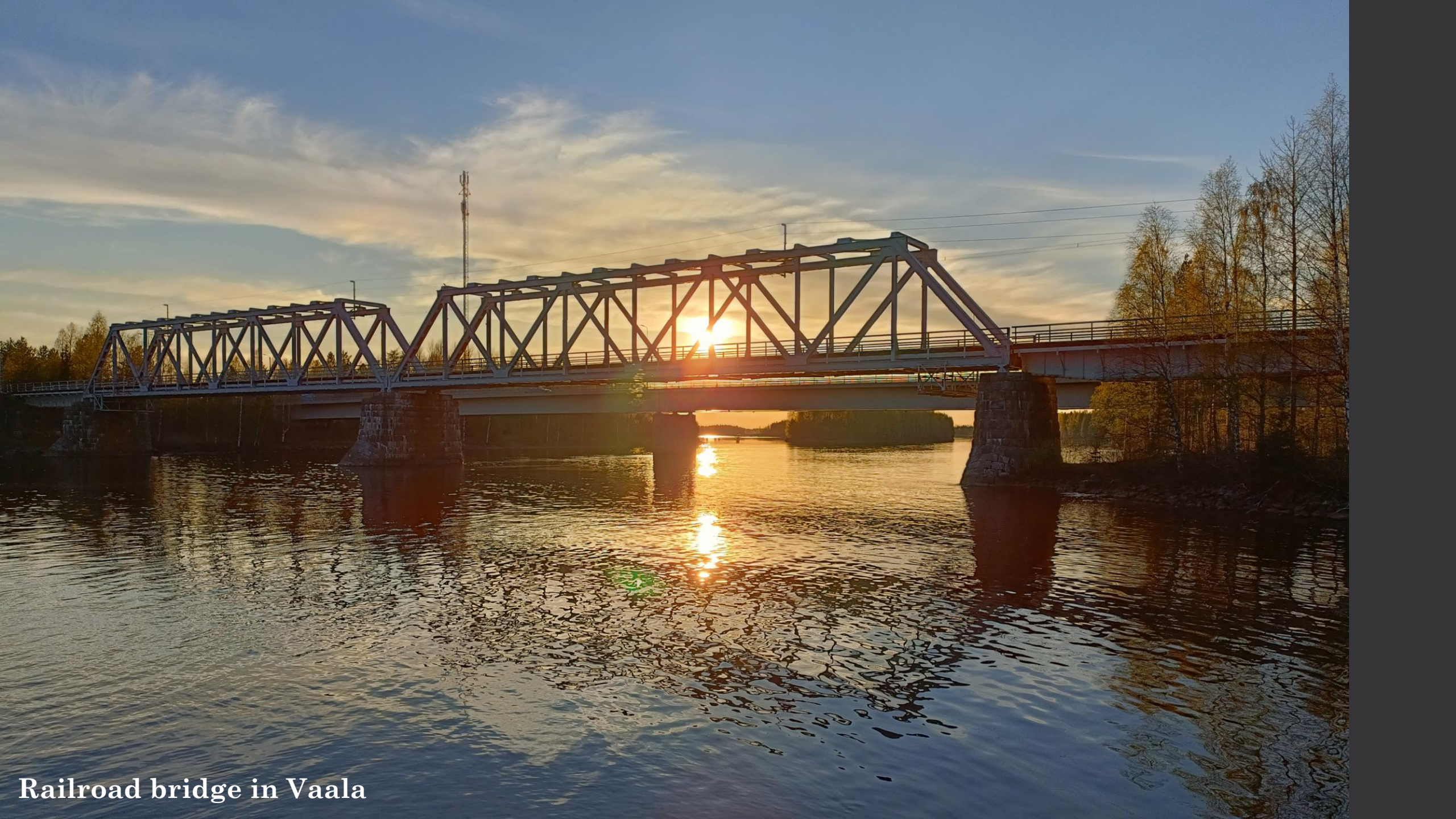
Railroad bridge in Vaala