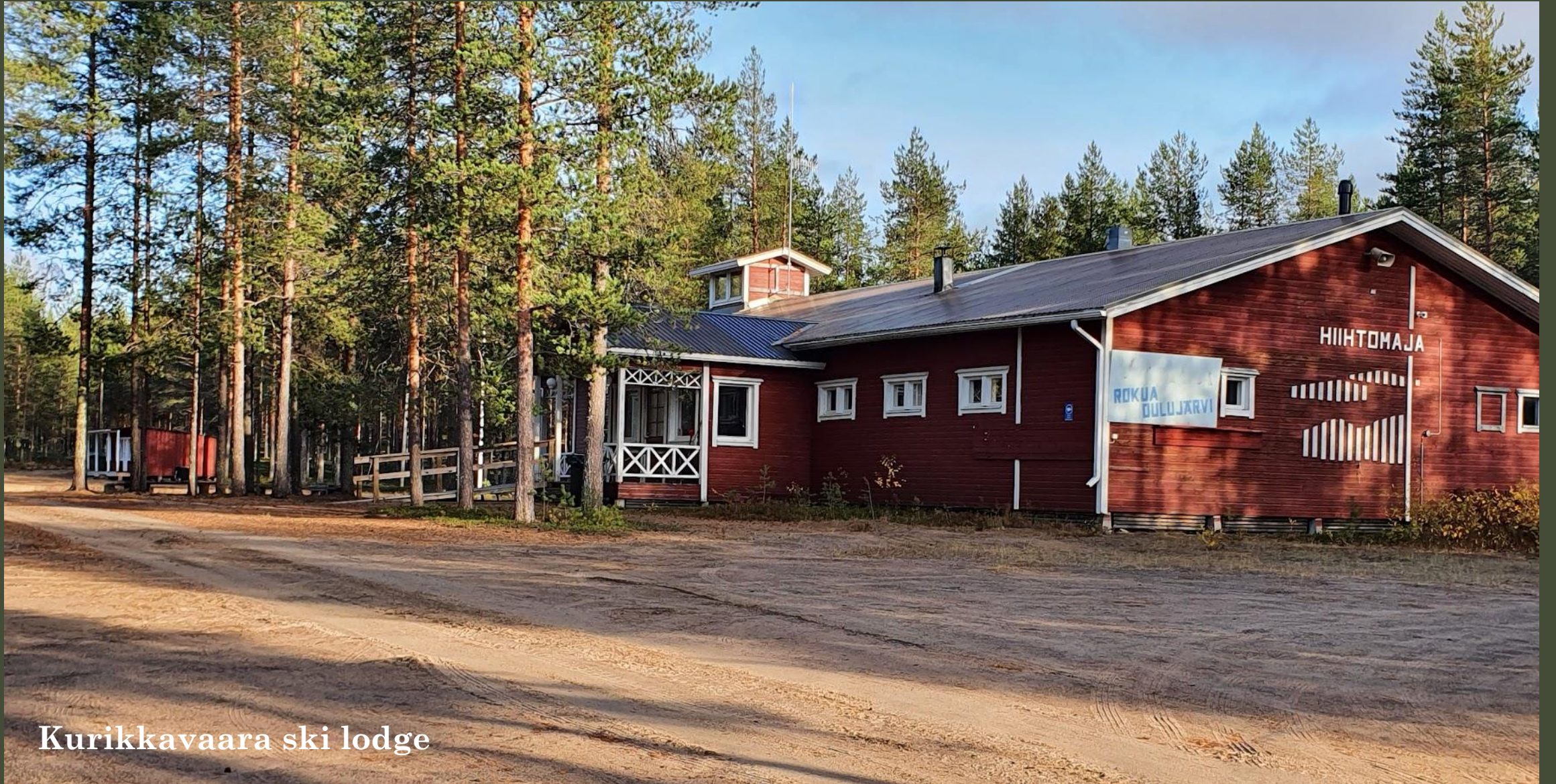
Kurikkavaara ski lodge