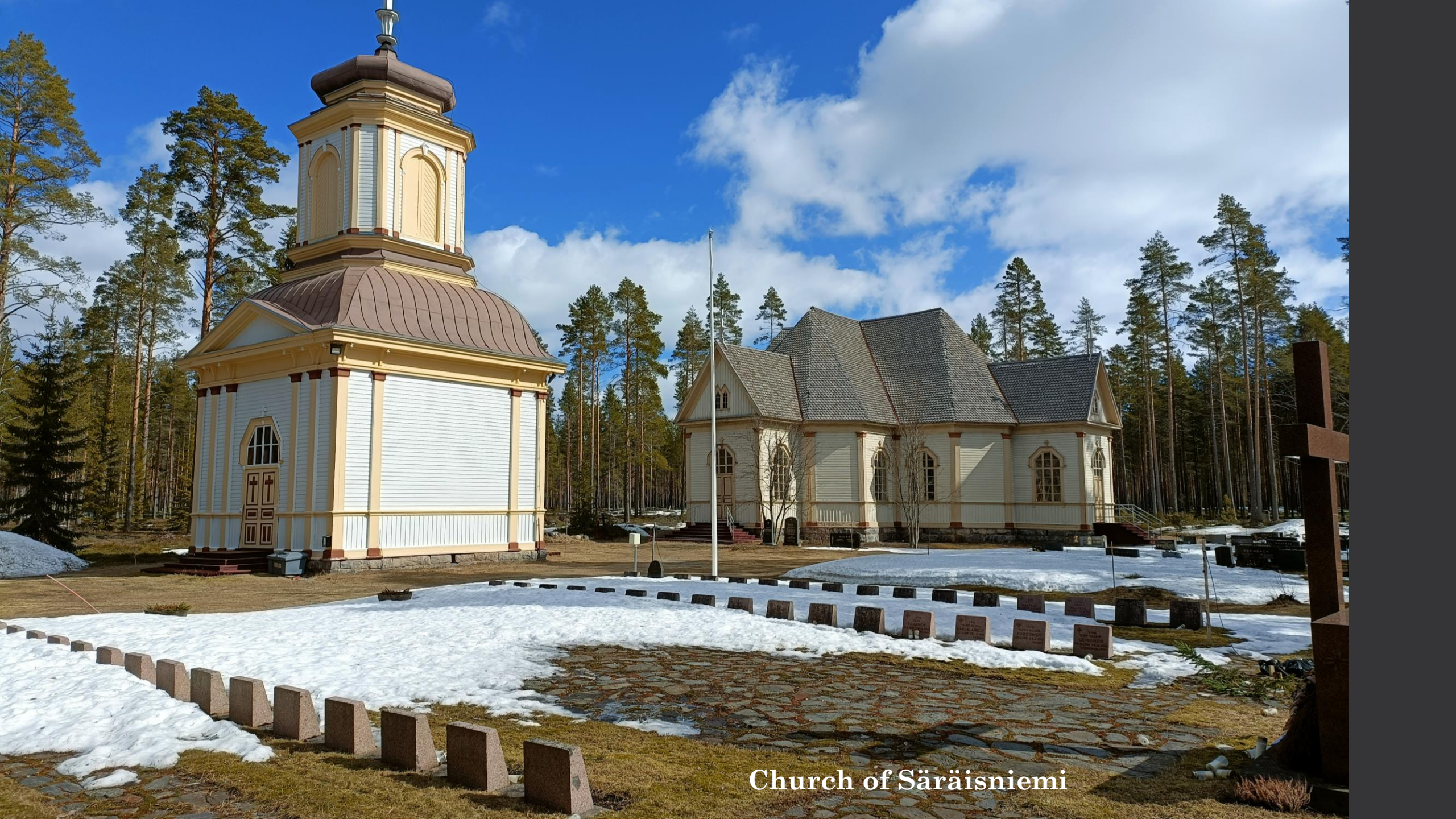
Church of Säräisniemi