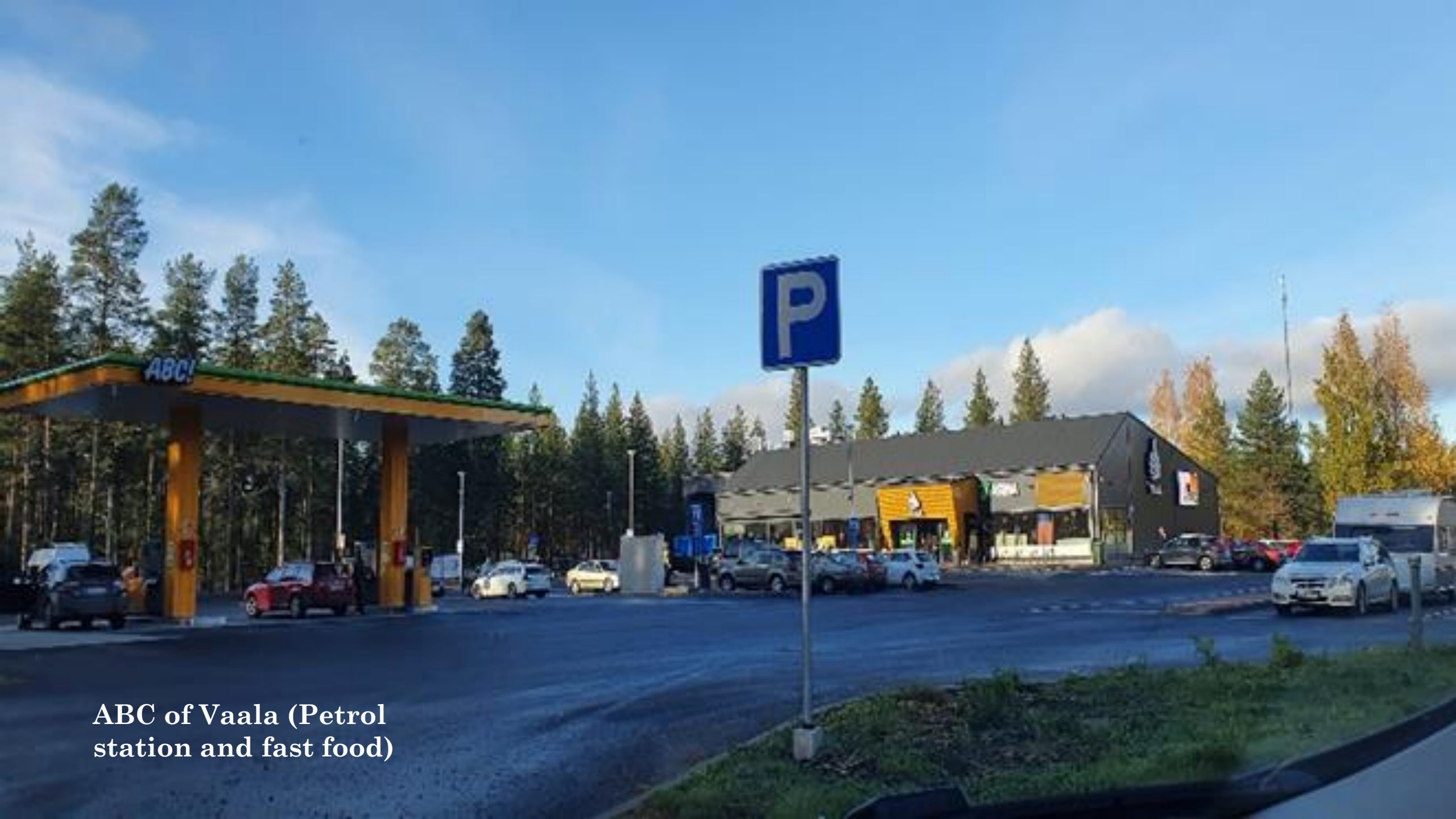
ABC of Vaala (Petrol station and fast food)