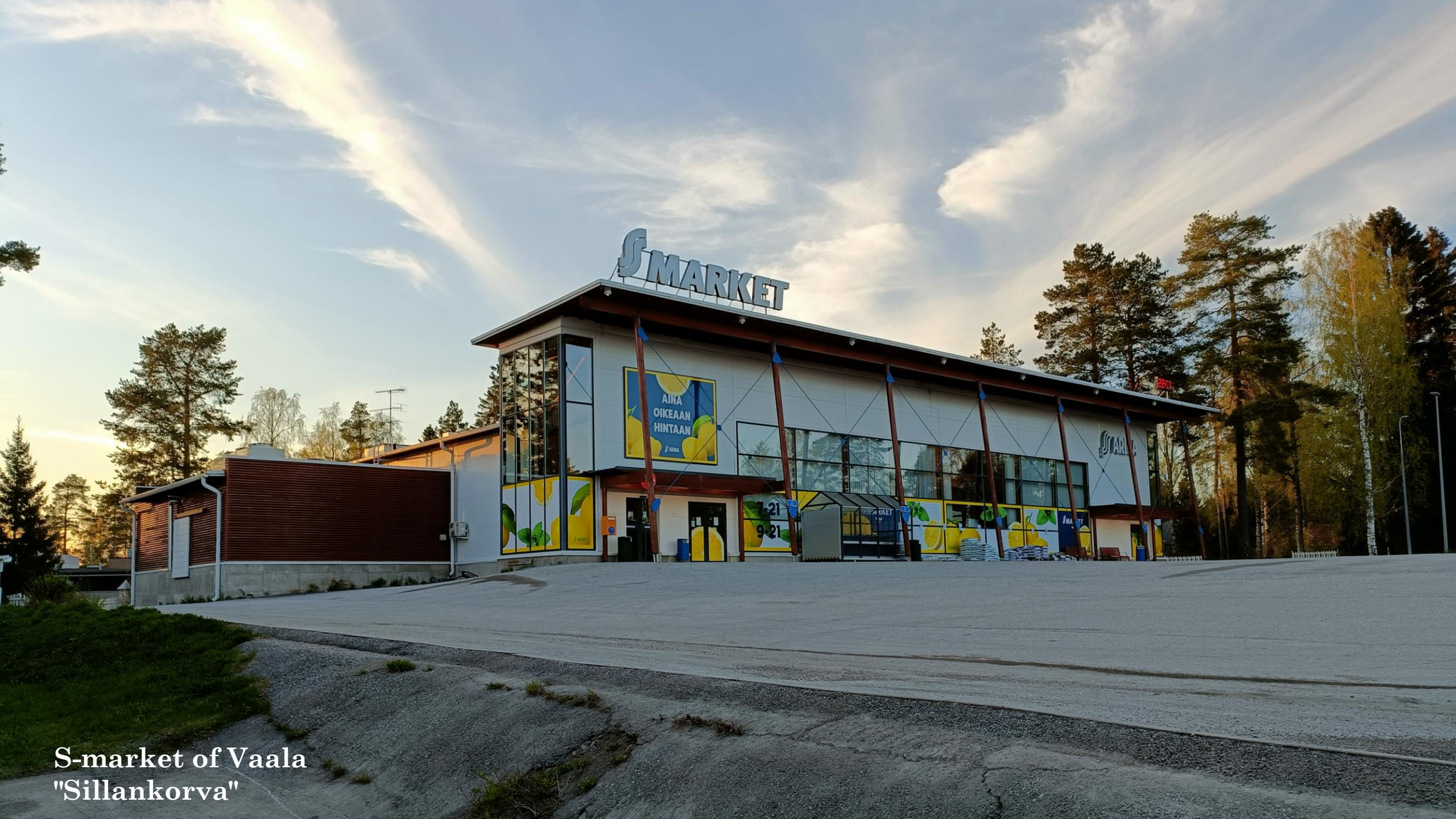
S-market of Vaala "Sillankorva"