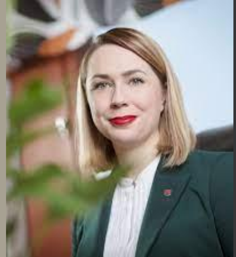
Municipality house and the Mayor of Vaala