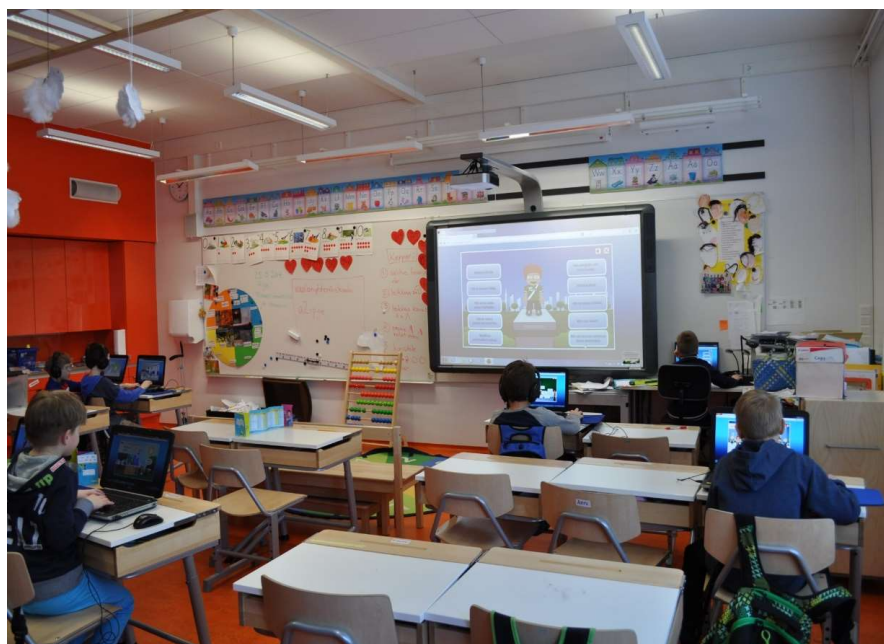
The classes from 1 to 6