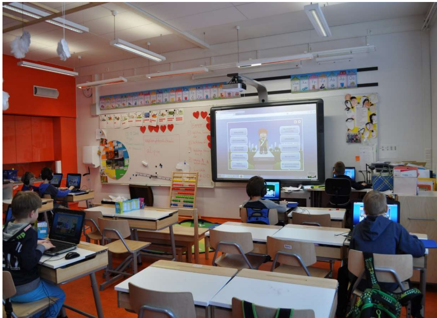
The classes from 1 to 6